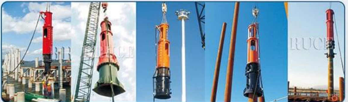
Hammers working with crane suspended type.

Copyright 2021 BRUCE Piling Equipment. All rights reserved. Note to Bruce Piling Equipment Users Restricted Rights