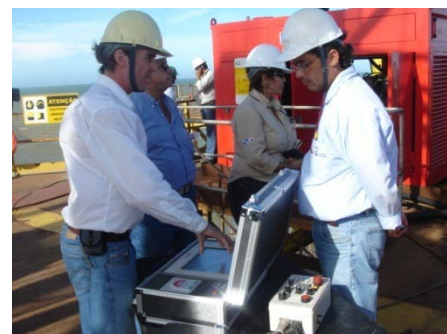
Engineers use the IEA system on site.

The BRUCE SGH-3013 uses to perform IEA system on production piles. IEA is essential for a driven pile foundation to estimate hammer energy efficiency at the time of this moment. If necessary, it is possible to adjust IEA system on the stroke height without checking the making line on the hammer. The IEA gives the engineer the option of determining the penetration depth for a single pile and it assesses hammer energy capacity, cumulative blows, blow rates etc, at a real time data interpretation. When the engineer is present for the IEA on site it displays all the job data and results, therefore, a field crew can evaluate the data such as blows per step, blow rate and energy per step through the IEA. It is an excellent managing way of protecting both pile materials and hammers.