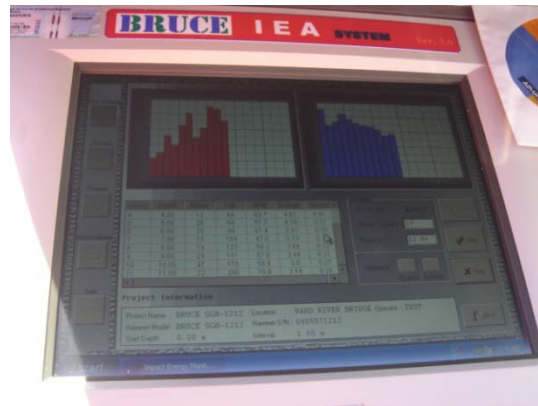
Energy efficiency displays on the screen.