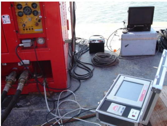
IEA is connected with hammer and power pack